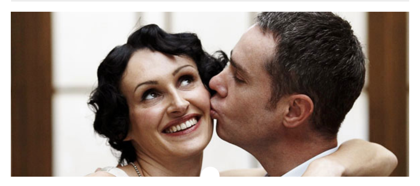
Subscribe: 12 weeks for $12